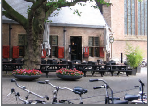
A charming restaurant in the city center.

Den Haag is located less than one hour (~50 minutes) by direct train from both Amsterdam's Schipol Airport (AMS) and