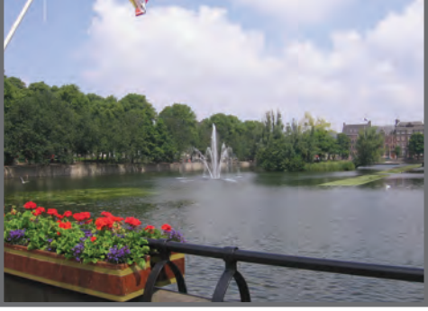
The lake behind the Parliment Building provides a welcome surprise to visitors.